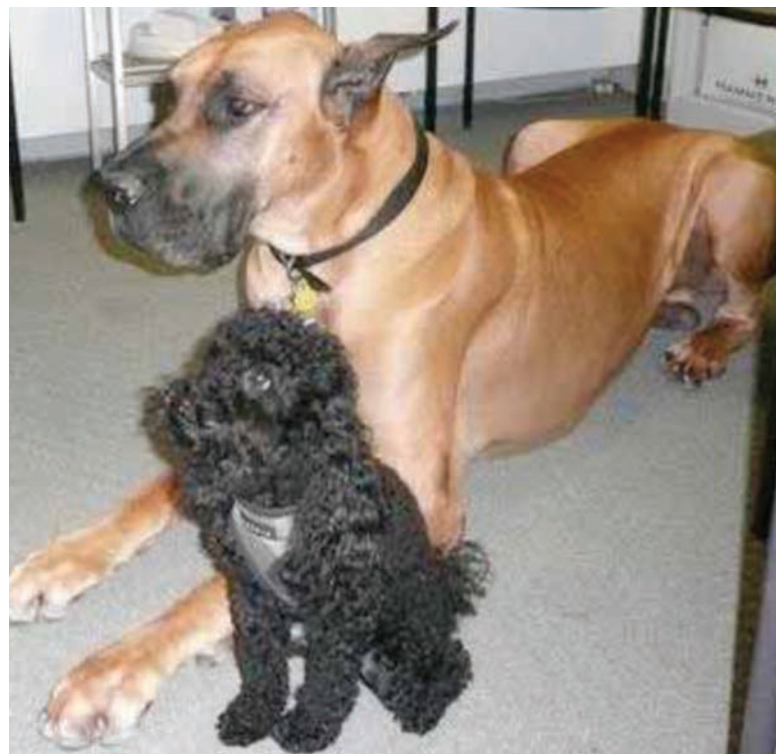
Certified by Therapy Dogs International, Inc. ‘Freddy’ and ‘Tiago’ are emotional service dogs waiting for their next patient appointments

As the project progresses, the hope is to develop a set of guidelines to share with other rehabilitation professionals. ●